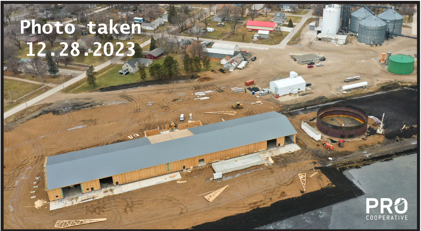
Photo taken 12.28.2023

The landscape in Terril has significantly changed this past month! As of Friday, Dec. 29, 2023, all the walls and rafters are up in the shop, agronomy center, load out bays and warehouse. The office's walls and rafters will be done early next week. The concrete has finished being poured for the winter, but the finishing touches will be poured around the building in the spring. Currently, the construction team is working to enclose the liquid side before the plumbing and piping crews arrive onsite mid-January. When the plumbing and piping crew arrives, they will start setting tanks and plumbing the liquid side in anticipation to be ready for spring and summer agronomy. Additionally, the UAN tank is about 60% done. With the beautiful weather so far this winter, we can very proudly say that this project, minus the office area, is currently on schedule to be complete by our spring agronomy season.