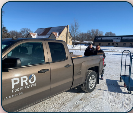
Pictured to the left: Emmet County's 50 Holiday Hams donation