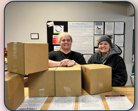
Pictured to the right: Pocahontas County's 40 Holiday Hams donation Pictured to the right bottom: Humboldt County's 50 Holiday Hams donation