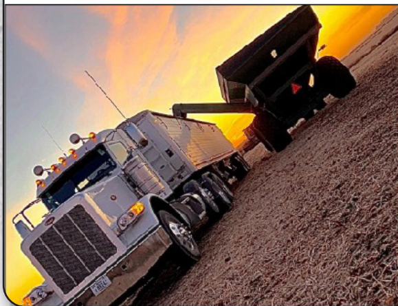
1st place - Employee Division