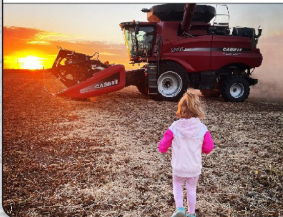
1st place - Public Division - People