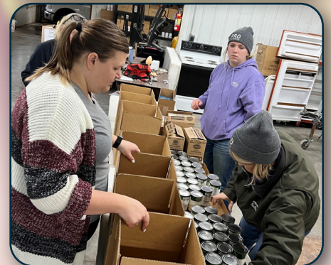
Pictured in the two photos above is some of the Pro Cooperative team members that helped assemble the 240 Holiday Hams.